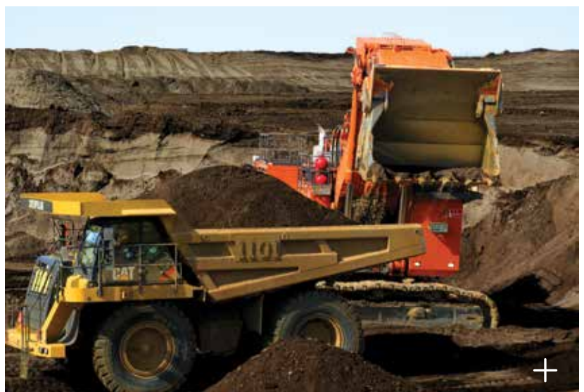
Fort Hills OPP project, Canada