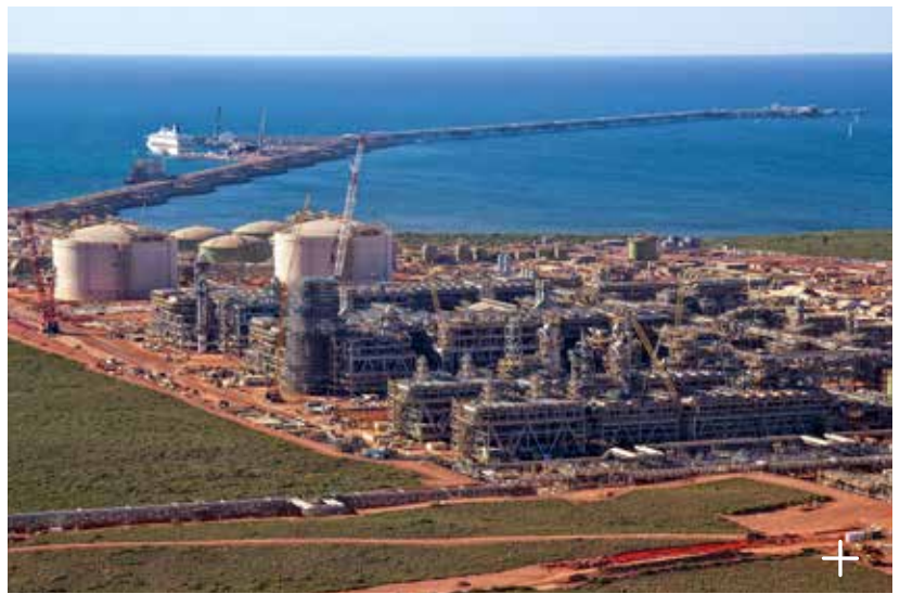
Gorgon LNG project, Barrow Island in Western Australia

This greenfield facility accepts 100,000 bpd of hot blended crude, and includes 300,000 bbl of tank storage, blending crude cooling, pumps and interconnecting piping to ship blended crude to various tie-in locations within existing sites. We completed FEED, detailed engineering and construction support to develop this new plot area.