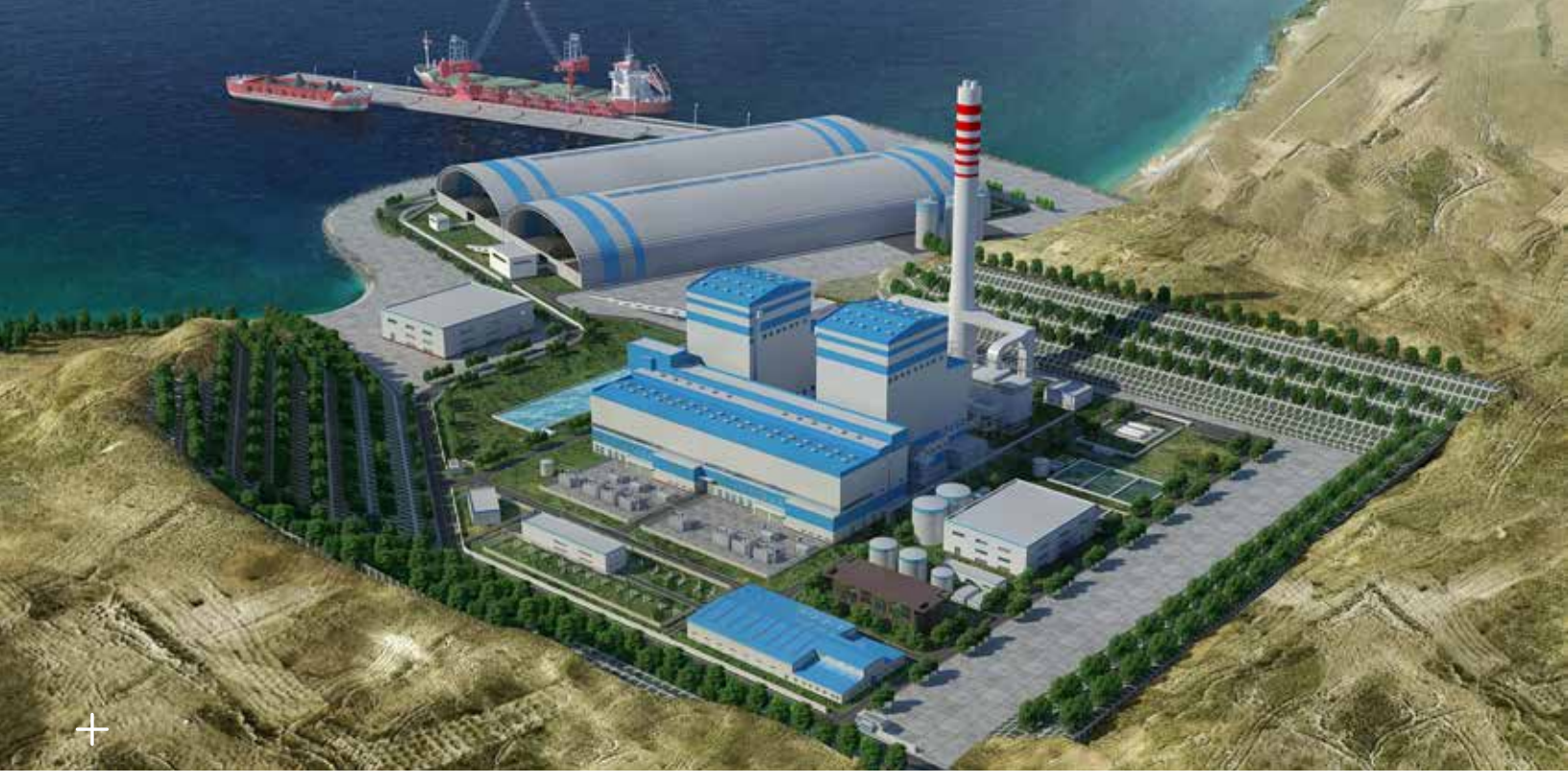
Hatch is the owner's engineer for the Karabiga thermal power project, a 1,320 MW ultra-supercritical coal-fired power plant in Turkey