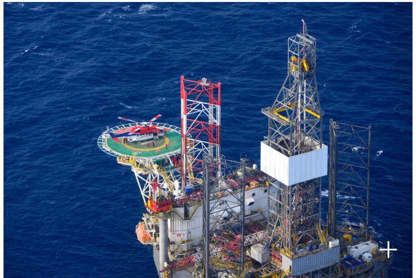
Offshore field developments, Europe's North Sea