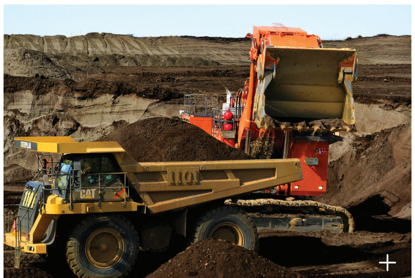
Sasol gasifiers project, South Africa