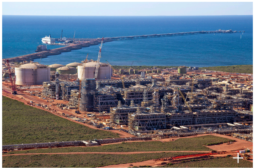
Gorgon LNG project, Barrow Island in Western Australia

This greenfield facility accepts 100,000 bpd of hot blended crude, and includes 300,000 bbl of tank storage, blending crude cooling, pumps and interconnecting piping to ship blended crude to various tie-in locations within existing sites. We completed FEED, detailed engineering and construction support to develop this new plot area.