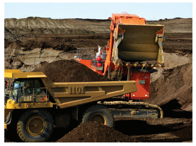
Fort Hills OPP project, Canada 13